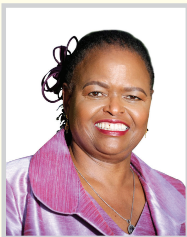
HON. JUSTICE MARTHA KOOME, EBS

Transformation Framework (JTF), Chief Justice Emeritus, Hon. Dr. Willy Mutunga made the fight against corruption a key pillar of his administration. He oversaw the establishment and institutionalization of the Office of the Judiciary Ombudsman (OJO) to handle integrity matters regarding all Judicial Officers and Staff.