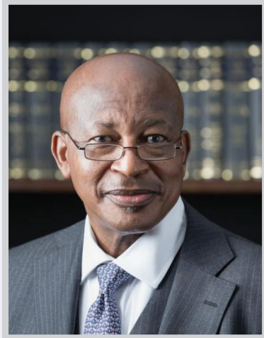
HON. JUSTICE (RTD) P. KIHARA KARUIKI, EGH

parties about the significant challenges and threats posed by corruption, and the link between corruption and other forms of crime.